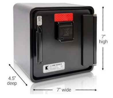
Knox Vault Series #4400